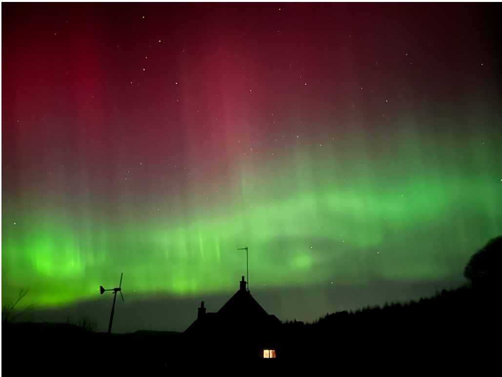
Northern Lights by Iain Richmond